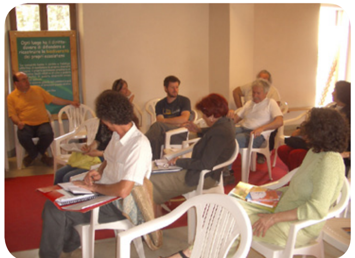
A few participants of the workshop on PGS on 30th May in Florence