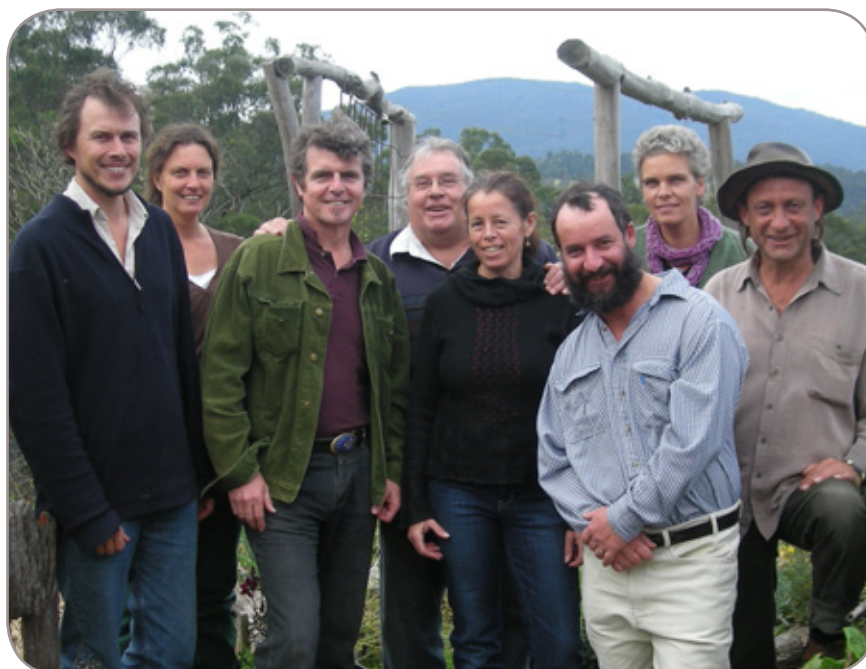
Some SOCS members who attended the meeting on the 29th of May.

must be taken from a cross-section of sites and soil-types over the areas to be certified. If soil tests show no traces of herbicides, synthetic fertilizers or harmful chemicals, and an initial inspection finds the property and practices suitable, SCPA will accept the grower and property as part of SOCS. Organic practices that meet the prescribed Organic Standards must be demonstrated over the first year before the grower/producer may claim 'In Conversion' status, followed by another two years meeting those Standards. Therefore it takes 3 years to attain the full status of 'Organic Certification'. The SCPA Organic Certification process is suitable for small producers, primarily supplying local or regional markets. It is an independent brand that relies on the integrity of member producers. The SCPA Organic Certification System adds value to the regional SCPA brand and enables us to share the knowledge of organic farming practices in a dynamic agricultural setting with member producers and the broader community through our communication networks. Through this expanding network and sharing the PGS structure and IFOAM standards, SCPA will stimulate more growers and draw markets and producers together. SCPA believes that the net carbon emission in the food supply chain is an important consideration to augment standard organic practices in the future, leading the way in promoting local produce direct to consumers.