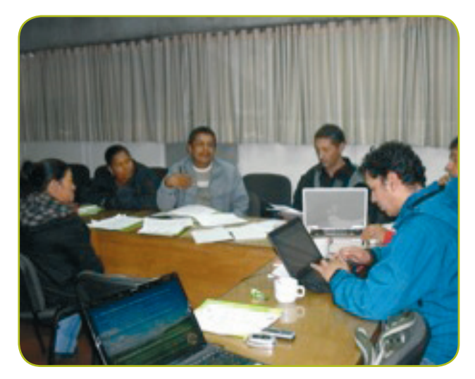
PGS initiatives representatives discussing in Bogota

One of the outcomes of the meeting was the recognition of the emerging need to build a national proposal to support and strengthen PGS, and to create a communication channel between the organizations. The aim is to advance with the coordinated work, taking advantage of the many different events being held by the organic and agroecological movement in Colombia, including the coming Latin American and Caribbean Producers, Producers, Innovators and Researchers in Organic Agriculture (ELAO) meeting, taking place in October.