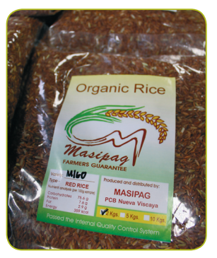
MASIPAG unpolished red rice. M160-1

busiest cities of Metropolitan Manila, Quezon City, where consumers are getting more conscious and aware of the importance of organic foods in their health and wellness.