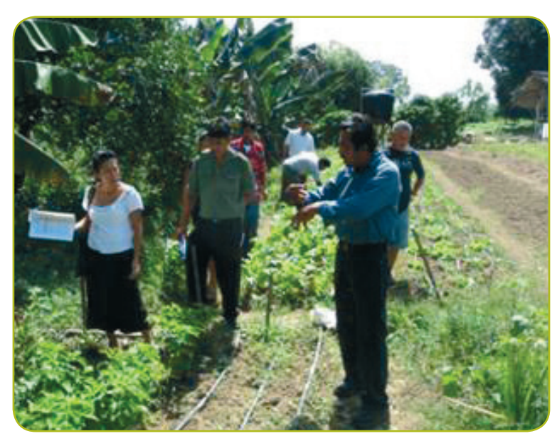
BOA stakeholders on the field

IICA and the Ministry of Agriculture and Fisheries of Belize. Also, farmers participate in administrative costs with a fee that they have agreed upon, in order to cover travel expenses, for example. Members receive training focusing on organizational skills, organic inspection, certification procedures and organic production practices.