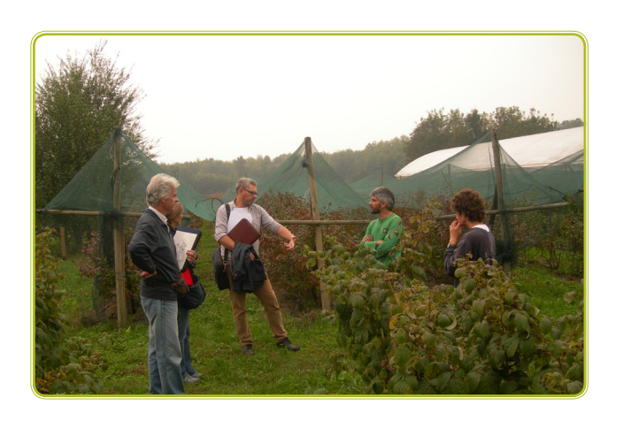
One of the farms visited in October, 2012

The PGS being tested is configured as a horizontal federation of local Committees, a network sharing rules and the guarantee mechanism, as well as operational resources (financial and technical). Three local Committees were formed and worked together in order to define unique protocols and rules.