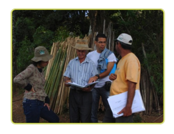
ABD PGS member during an inspection by the government

It includes 60 different organizational processes and a solid organic structure based on their local communities and territorial organizations. The Mexican Network of Organic Tianguis and Markets, Mexico, is a self-managed initiative comprised of 28 local groups in 12 states. The Mexican experience has been one of the most persistent in introducing improvements in the overall management of the process, and is acknowledged as a main counterpart to build national organic policies.