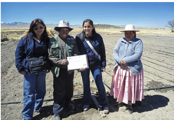
Bolivian farmers after receiving their organic certification

Within the framework of its program, TDC has been supporting the Bolivian organization AOPEB (Asociación de Organizaciones de Productores Ecológicos de Bolivia) since 2010. AOPEB represents and brings together organic farmer organizations and aims to increase the sales of organic products on the Bolivian domestic market through PGS.