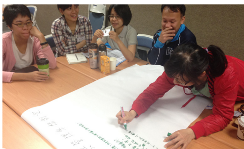
Participants at the PGS Workshop in Taiwan

After the first few minutes of staring at each other and a blank sheet of paper, the workshop really came to life, and an hour later, we had people on top of tables, drawing, gesticulating, debating and developing – participatory development in