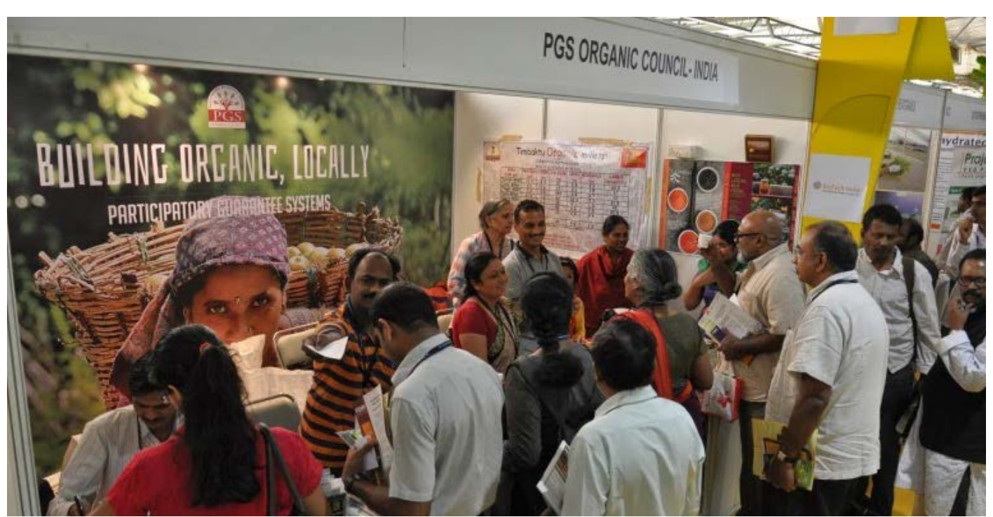
PGS farmers groups interacting with consumers at Biofach-India