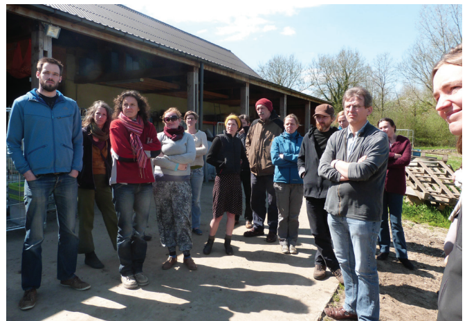
Introduction days of Voedselteams at the farm 't Uilenbos, in Moerbeke-Waes

It is undeniable that PGS is gaining ground in Belgium as there are also other groups like the CSA-inspired GASAP in the region of Brussels that are actively preparing a PGS. I'm definitely looking forward to meeting people from all these PGS initiatives and to exchanging ideas about how we can all contribute to a more sustainable food system.