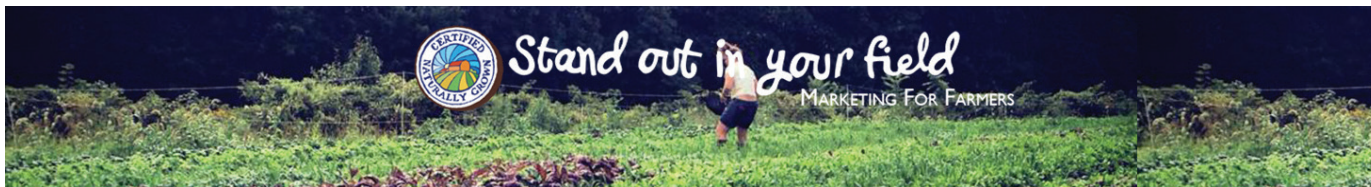
Website banner with CNG logo

a Press Release, Branding, and making and sharing videos about farms. Lessons are available for free on our website, though more detailed lessons are made available for downloading to those who register for updates on the website with their email. A series of short blog posts feature “Shining Examples,” farmers who excel at these marketing techniques, and provides more detailed examples of how it is done (like how Instagram is used by CNG member Origins Farm ).