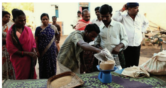
PGS Farmers in Dharani Cooperative collectively selling rice

Going forward, the government of India plans to involve more civil society organizations to significantly increase the number of small holders involved in PGS. This is expected to go up from the current number of approximately 25,000 to over 1.2 million farmers. As a way to upscale the benefits of PGS for smallholders, it is expected that the government through its nodal department, National Center of Organic Farming (NCOF) will invest heavily in promoting the ideals of PGS in India, to make it one of the biggest such inclusive program in the world.