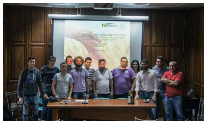
PGS Cloud Meeting

At the moment, Software Design and L'Officina GBS are cooperating with several producers and consumers organized in Ethical Purchasing Groups (e.g. Community Supported Agriculture, called GAS in Italy) to create two PGS in the territories of the Murgia and Gargano National Parks , in Apulia (Italy). The project involves many stakeholders who play a key role in local rural development: farmers, consumers, agritourism operators, environmental educational centers, national parks and artisans. Approximately forty farmers are involved; they produce cheese, vegetables, fruit, extra virgin olive oil, wine, meat, almonds and legumes. About 30% of these farmers are third party certified as organic; the others are not certified, but follow organic principles.