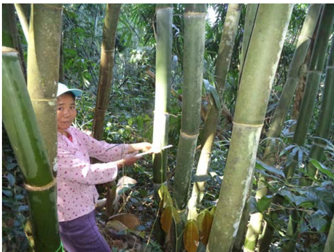
First phase in dried bamboo shoot production

PU members have been settled in four villages and motivated producer leaders took on the management. The PU members were then trained by the BbPj to buy fresh shoots from village harvesters, then processed into high quality dried shoots and contracted and sold to the Vietnamese social-enterprise Ecomart, which supports the commercialization of PGS-certified vegetables and organically-produced dried shoots in Vietnam. Through a participatory learning process, the PUs achieved significant improvements in terms of organization, business skills and quality production. They also started to understand about the direct linkage between improved product quality, organic certification, premium price and increased market access (domestic and trans-border).