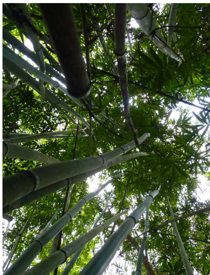
Nor Hok bamboo

Through a continuous learning process, the PU members, who initially had limited understanding of the PGS concept, have evolved into fully engaged actors creating the PGS-Stakeholder Group Hauphanh, with a fully self-developed pledge, standard, organization structure, rules and compliance.