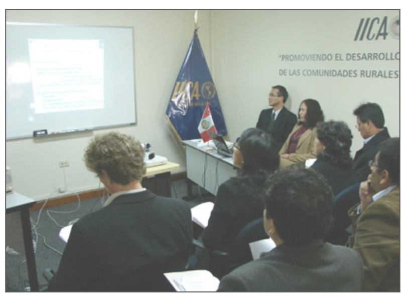
Virtual\ participation\ at\ the\ hemispheric\ video\ conference\ on\ organic\ guarantee\ systems, September\ 28-30, 2009\ (See\ next\ page.)